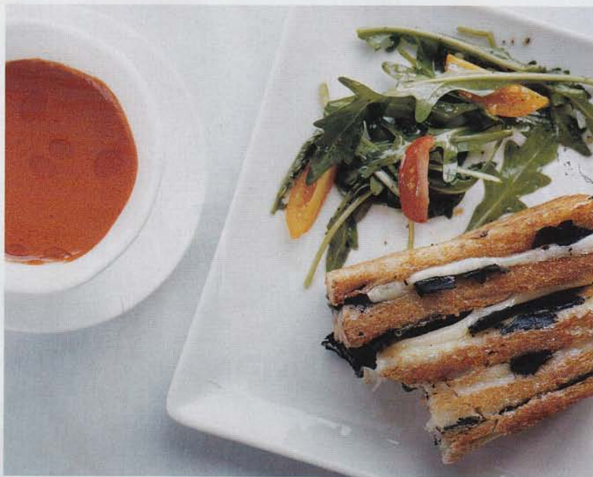
Comfort food invades Manhattan: Souped-up grilled cheese at the Mandarin Oriental.