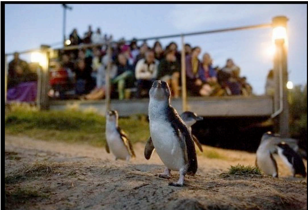
Penguins arriving at Penguin plus.