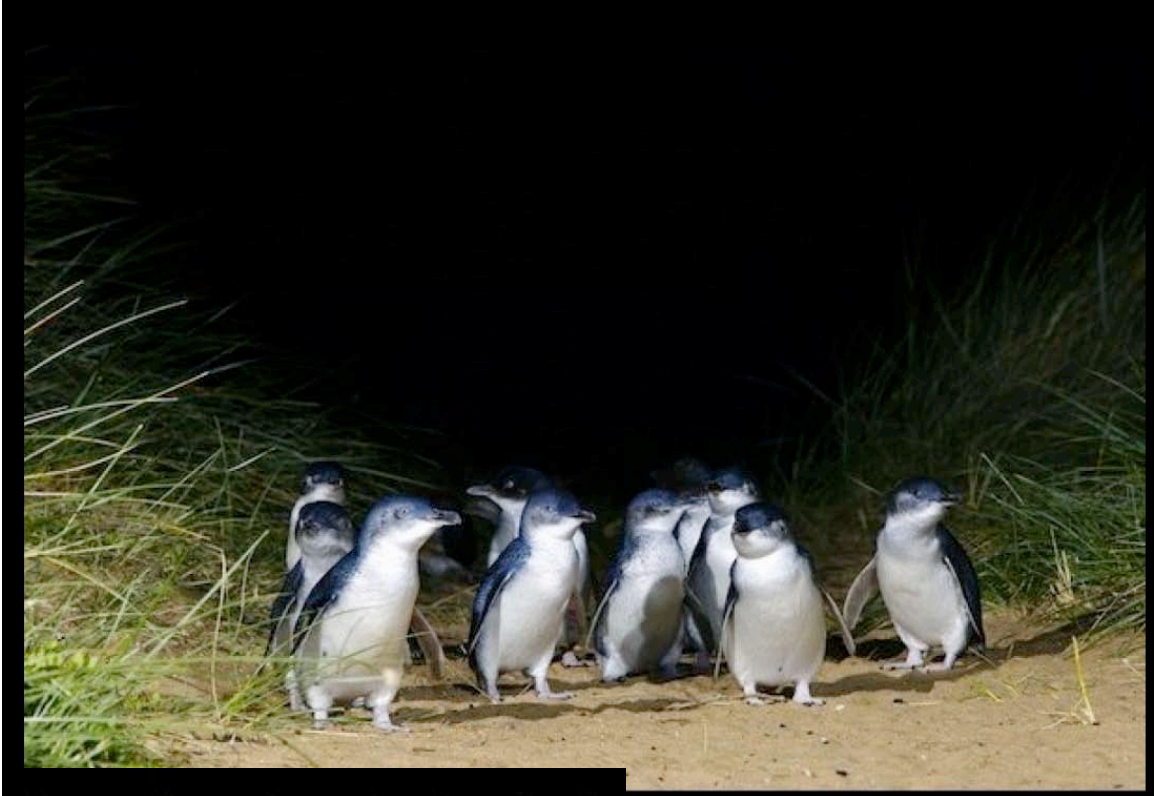
Group of penguins coming down beach.