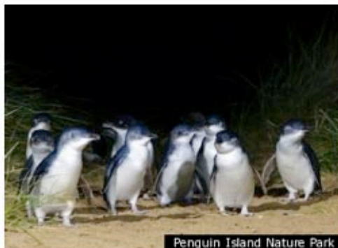
Penguin Island Nature Park