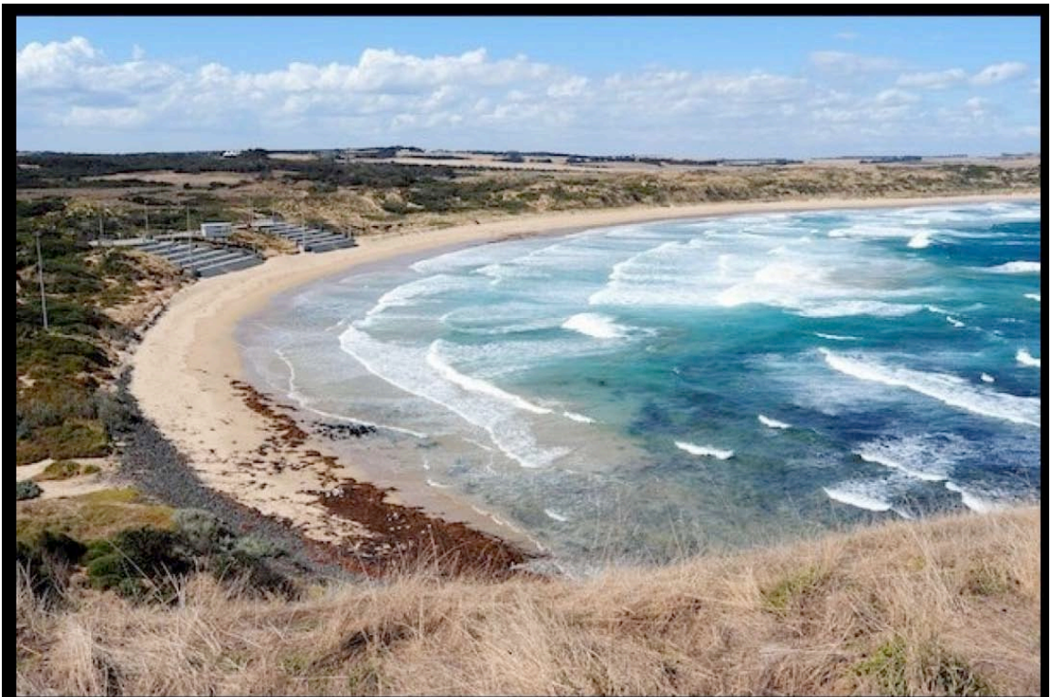
View over summerlands beach & penguin parade stands.