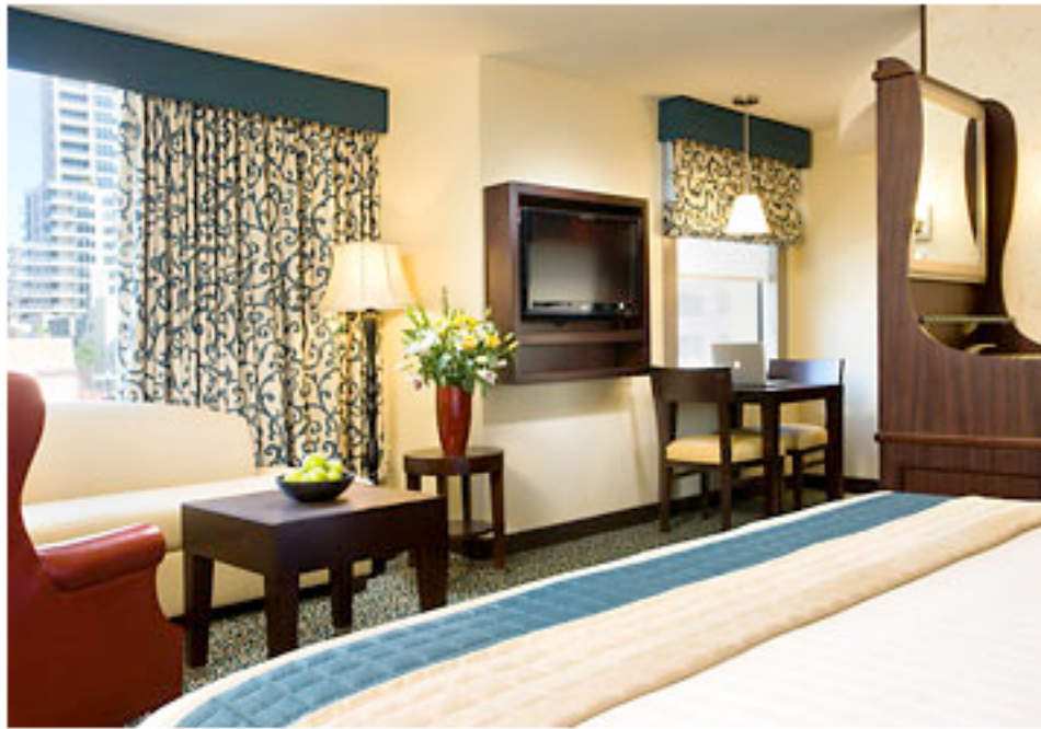
The Studio Suite