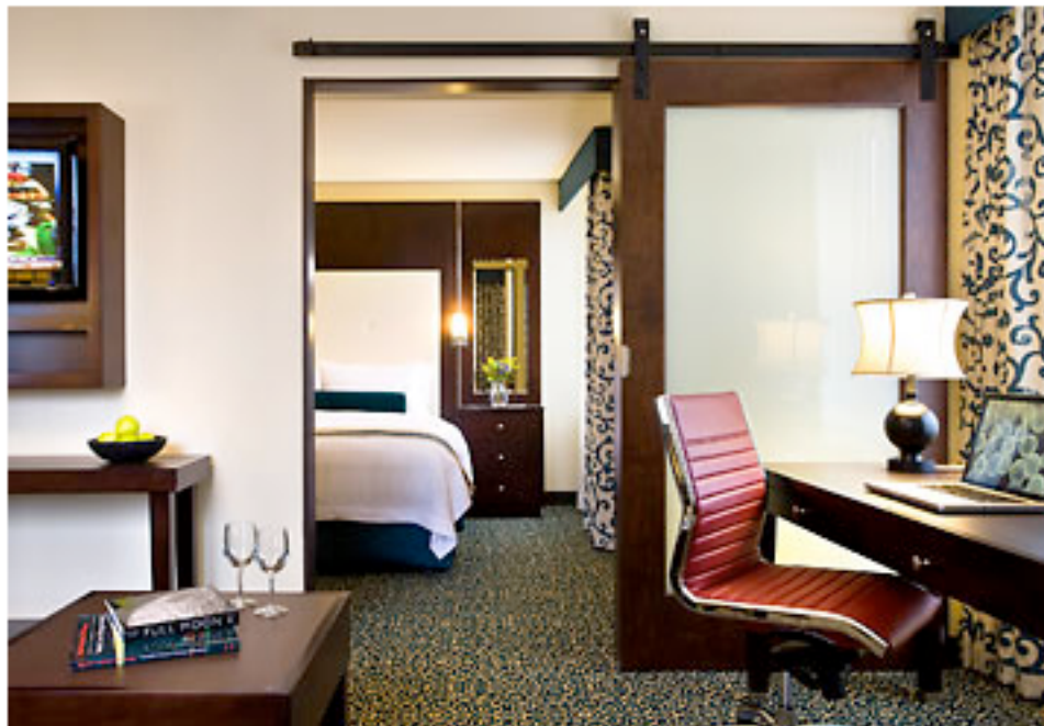
The One Bedroom Suite